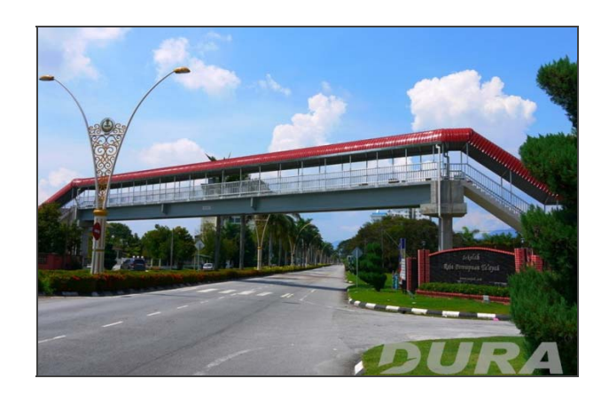
TBG1325-40m for construction of pedestrian bridge (Ipoh).