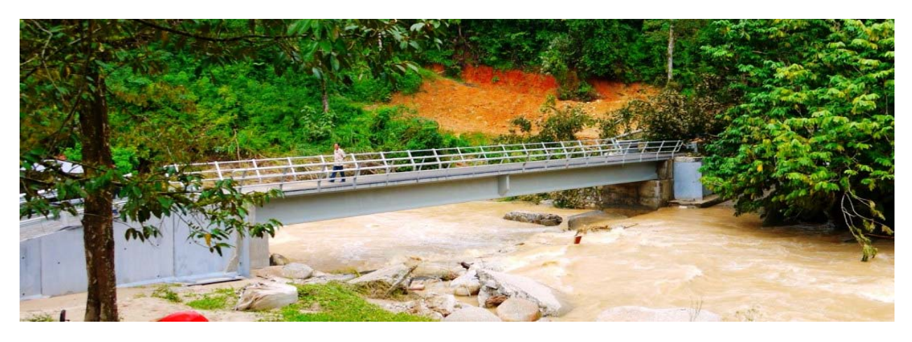
Figure 1 – A 25m single span medium traffic bridge crossing Sungai Itek (Kg. Ulu geroh, Gopeng, Perak) using two pieces of DURA® TBG1325.