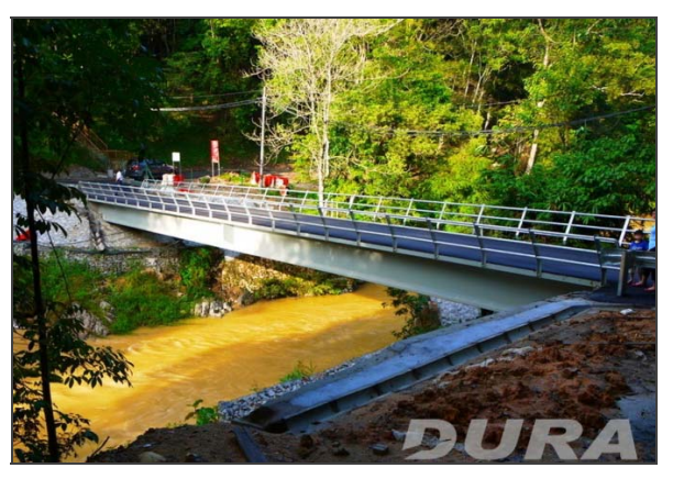
Rural bridge built within 3 months using TBG1325-32m.